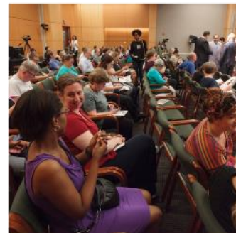
Cultural Programs of the NAS