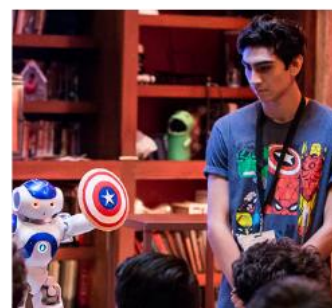
The Science & Entertainment Exchange