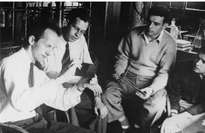
From left: Michael Kasha, Donald S. McClure, George C. Pimentel and William T. Simpson.

the mixing of singlet and triplet states and the resulting effect on the emission lifetimes: the greater the charge of the nuclei, the shorter the lifetime of the phosphorescence. The measured lifetimes strikingly confirmed this relationship. But even after much such evidence had been reported, it still took many years to convince everybody.