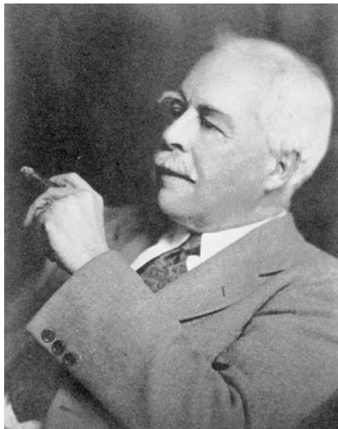
Gilbert N. Lewis.