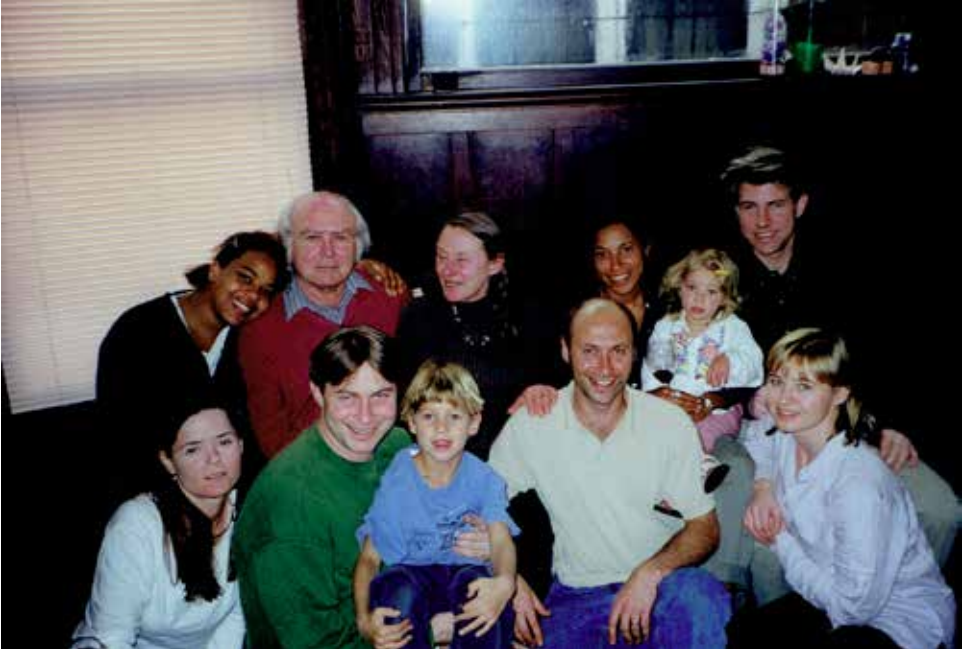
Family and friends gathering for a surprise celebration of the author's 60th birthday.