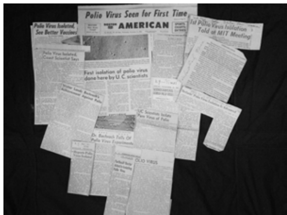
Headlines heralding the poliovirus breakthrough discovery (circa 1954).