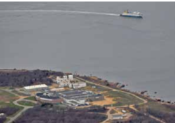
Plum Island Animal Disease Center (circa 1985).