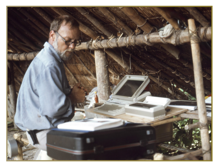
Figure 2 Napoleon Chagnon using his solar rechargeable laptop in the field

your outboard motor won't start or the canoe's transom splits, you fix it. As an example, in the early 1980s we were one of the first to use solar rechargeable laptops in the field. Unfortunately, his dual-diskette model had open bays. Once, as he was about to insert a diskette, he spied a couple insect legs sticking out of his computer—a cockroach in the drive bay! Inserting a diskette would have crushed the critter and ruined the readwrite heads. So, he rolled up a strip of duct tape, sticky side out, and I gave him some of my precious peanut butter as bait on the tape. The cockroach quickly sensed the meal and crawled out, getting stuck on the tape. He literally debugged his laptop! (See Fig. 2 for the laptop and trusty duct tape roll.)