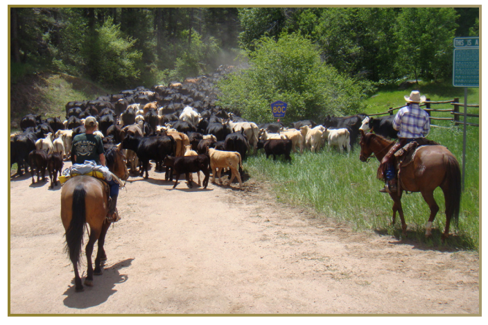
Figure 2 Seidel cattle drive.

management that continued and expanded until his passing. He also provided access to the ranch to students and colleagues across the university for a variety of educational experiences, from range management classes to training veterinarians and graduate students in a variety of reproductive techniques and protocols. For many, his ranches provided a truly Western experience that included spring calf branding, barn parties, and days-long cattle drives on horseback to public lands at the beginning of the warm months and back again in early fall (Figure 2). These spectacles were complete with cowboy campouts, though today some modern conveniences have been incorporated.