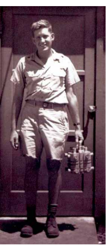
Harold Agnew in 1945 holding the plutonium core of the Nagasaki bomb. Tinian Island.

and field an electronic gauge that would telemeter the time profile of the acoustic wave it received, having descended by parachute from a chase plane as the bomb itself was dropped on its target.