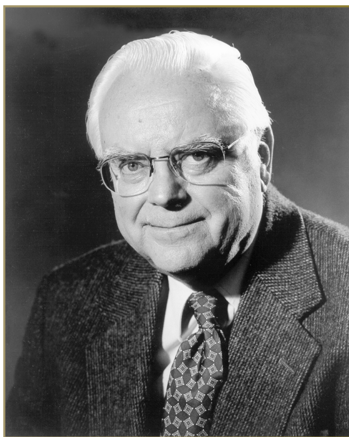
Figure 1 Frank D. Drake.