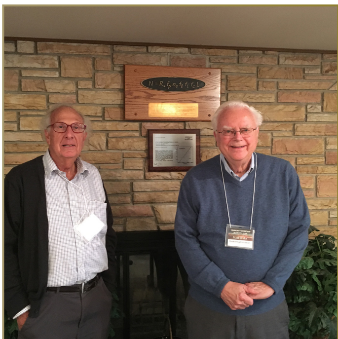
Figure 3 Frank Drake (right) and the author (left) taken in July 2019 during an astrobiology conference held in Green Bank. The setting is the room, now known as the “Drake Lounge,” where Drake first presented his 1961 Drake equation, shown on the memorial plaque in the background.