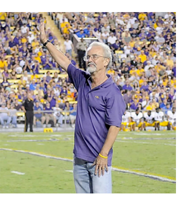
LSU recognizes one of its most distinguished scientists, Ward Plummer, at the start of a football game.

of fashionable "quantum materials." He made several important discoveries, including the existence of multipole plasmon modes localized at surfaces of simple metals. These modes are currently of interest in the growing field of nano plasmonics, an area that Ward and collaborators offered insights into in a review article.<sup>10</sup>