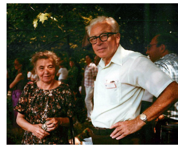
Olga Ladyzhenskaya and David Gilbarg

In 1956 Jim published a joint paper with Gilbarg. Here the Harnack inequality was used to study the local behavior of solutions of linear elliptic partial differential equations in arbitrarily many dimensions. The equations may or may not be in divergence form, and the continuity assumptions on the coefficients are quite weak and are consistent with the known existence and uniqueness theory. The results include an extended maximum principle for solutions with a singular point, asymptotic and limit behavior of solutions, a Liouville theorem, and the characterization of the fundamental solution. The effect of the continuity properties of the coefficients on the behavior of solutions were illustrated in